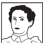
photo restoration & retouching

Flat-rate depending upon scope of project.